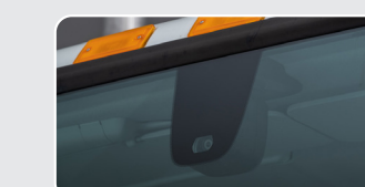
WABCO OnLaneALERT™ Lane Departure Warning System

*All features and options are subject to change without notice. **For more model specifications, contact your local Hino dealer. *Running change.