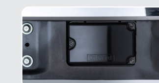
WABCO OnGuardACTIVE™ Collision Mitigation with Adaptive Cruise Control & Electronic Stability Control